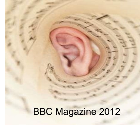
BBC Magazine 2012